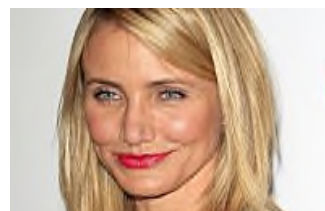
The Best Hair Colors for