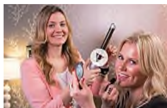
All the Red Carpet