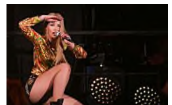
Iggy Azalea Suffers