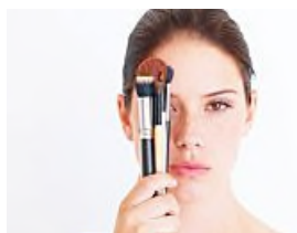
Simple Makeup That