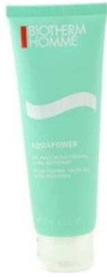
StrawberryNET.com Biotherm Homme Aq... $32.00 StrawberryNET.com