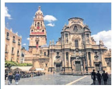
MURCIA THE MERRIER ... town's stunning cathedral, Roman theatre at Cartagena, below, and picturesque harbour at Cabo de Palos, bottom

The stunning Hotel Puerto Juan Montiel was our next base and it absolutely gave us everything we needed. It's flanked by palm trees and overlooks a stunning harbour, packed with beautiful boats and yachts. No surprises that it's popular for its watersports