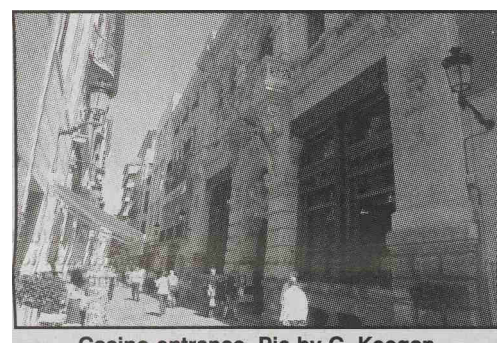
Casino entrance.

region (under 1 hour drive from Murcia) it is very