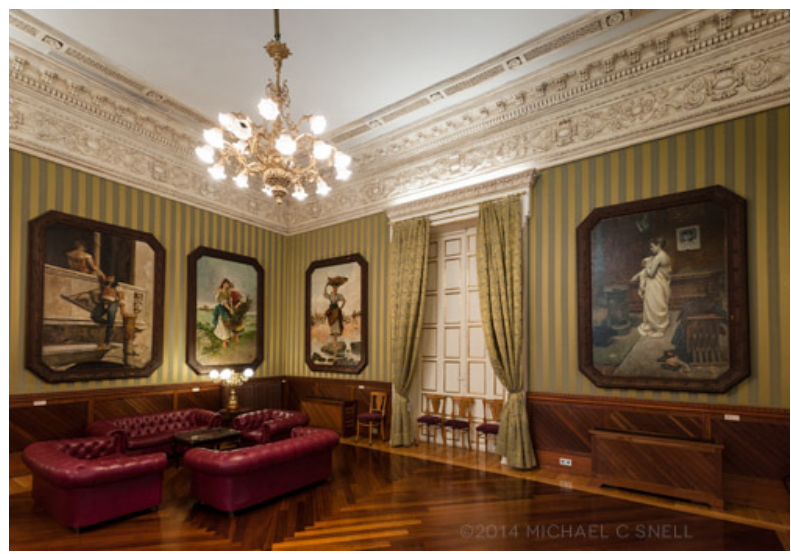
Continuing inside, the ornamentation becomes a tiny bit more restrained, but it is still extravagant. Sitting rooms, ballrooms, libraries, and sculpture galleries: all the things you need to survive in style.