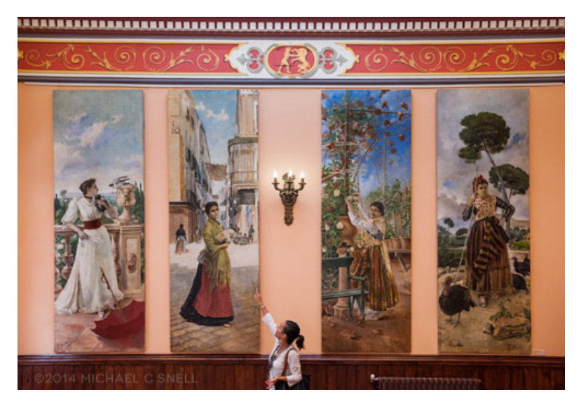
Nearly life-sized paintings of women in traditional Murcian dress hang in one room, but my favorite space was the billiard hall: