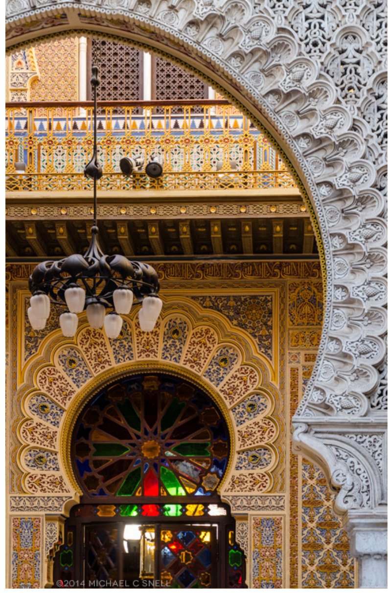
Upon entering, you find yourself in this multi-story, glass canopied foyer. For those of you that saw <u>my post on the Alhambra</u>, this is like seeing that building in all its multi-colored splendor. It's truly incredible.