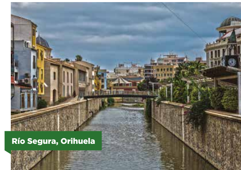
Río Segura, Orihuela