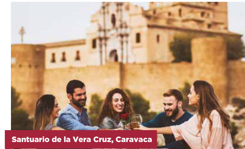
Santuario de la Vera Cruz, Caravaca