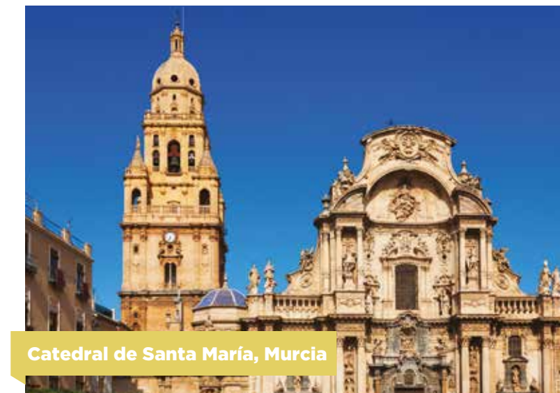
Catedral de Santa María, Murcia