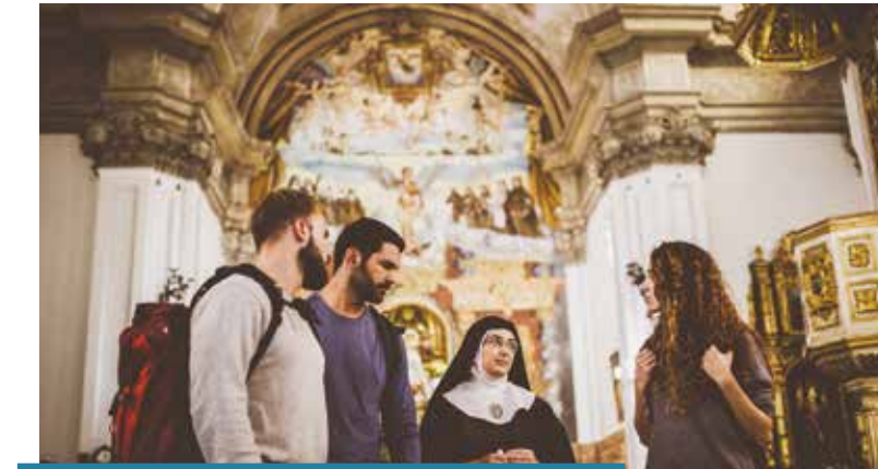
Real Monasterio de la Encarnación, Mula